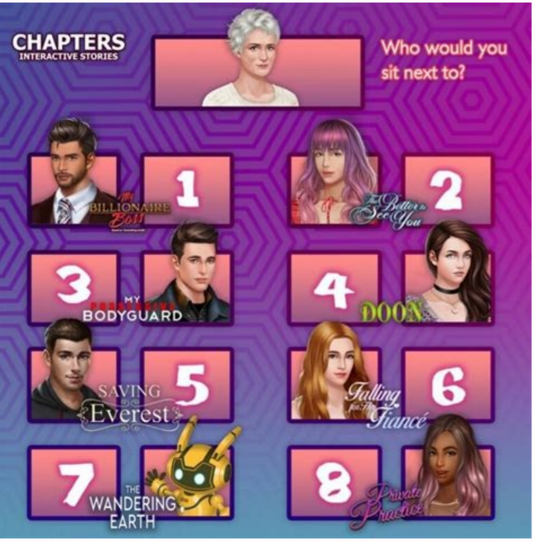
Maybe interactive stories mod apk. Maybe interactive stories mod apk unlimited tickets and diamonds. Love sick interactive stories mod apk. Chapters interactive stories mod apk (unlimited diamonds tickets). Scandal interactive stories mod apk. Chapters interactive stories mod apk. Escape interactive stories mod apk. Whispers interactive stories mod apk.